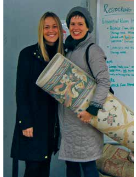
Goods donors are critical to Household Goods.