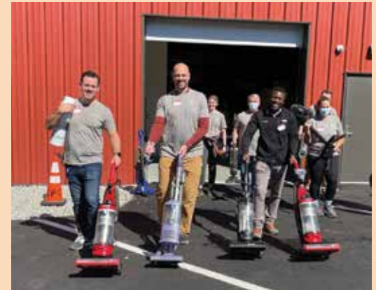
DPS Group volunteers ready their vaccuums.

Groups from businesses large and small, schools, and community organizations are an important part of our volunteer effort. In 2022, 49 groups took on special projects and helped with the constant effort required to collect, process, and distribute nearly 70,000 household items to those in need.