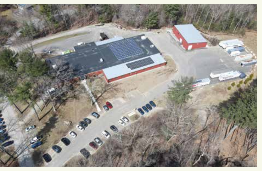
Overview of our expanded campus